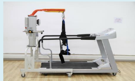
Equipment for a suspension type system includes a treadmill, overhead suspension system, and harness 2

Some body weight supported treadmill training systems may also involve the use of computer systems which control the training and/or robotic systems which guide movement of the legs.