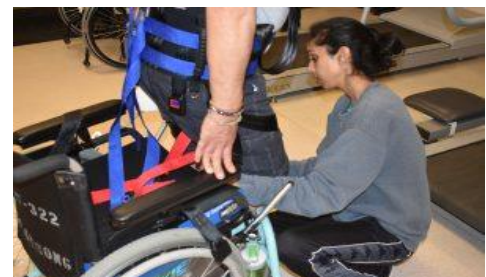
Female clinician adjusting the harness, preparing a man for the treadmill. 3