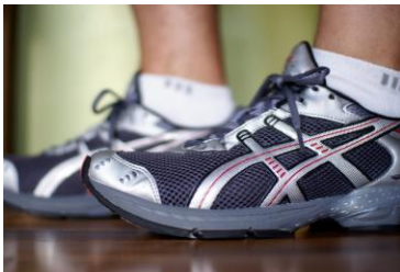
Standing is a therapy option following SCI. 1

Standing is an important part of functional movement in humans. Standing is needed for walking, and also provides a challenge to the circulatory system, bones, and muscles in ways that cannot be achieved in sitting or lying.