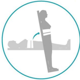
Tilt tables can be moved from a horizontal to a vertical position. 2