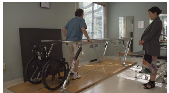
Standing and stepping activities may be combined to optimize therapy. 5