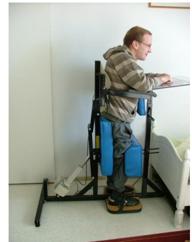
Standing using a standing frame. 3