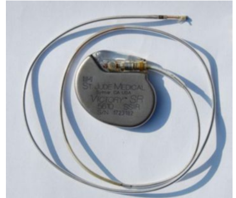
TENS can interfere with the function of cardiac pacemakers. 4