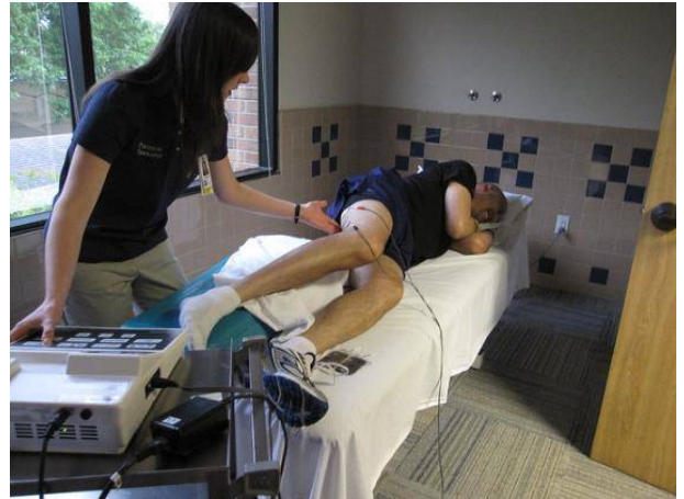
A health provider using TENS on a person's leg 5

Reviews of research studies done in conditions like knee arthritis, general acute pain, and chronic low back pain have shown that TENS may be effective for treating musculoskeletal pain from these conditions. However, much of the research included in these reviews (and for TENS generally) is low quality, making it hard to make strong conclusions about whether TENS works for musculoskeletal pain.