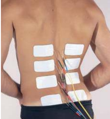
Electrodes placed on the skin 2

The machine is connected to a set of electrodes by electrical wires (leads). The electrodes may be self-adhesive or applied with conductive gel onto clean, intact skin. Electrodes may be placed near the area of your symptoms or in other areas directed by your health provider.