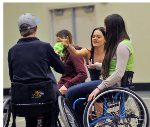
Peer mentors can offer emotional support and practical advice on living with a SCI. 11

Recreational therapists specialize in developing the abilities needed to participate in leisure activities.