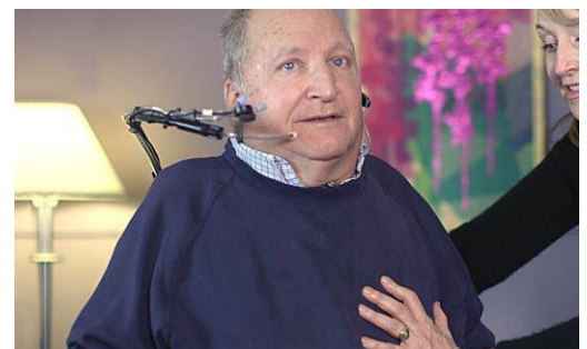
Some people with SCI need help with breathing and coughing. 5

Autonomic dysreflexia involves recognizing autonomic dysreflexia and understanding how to prevent and treat it.