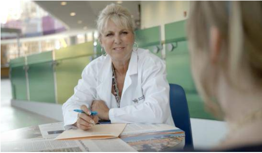
Working with a sexual health clinician may be a part of rehabilitation. 6

Blood pressure care may involve learning to manage and care for orthostatic hypotension and other blood pressure problems using medications, exercise, compression garments, or change to salt and fluid intake.