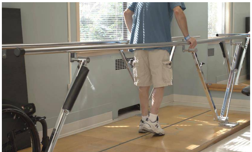
Part of rehabilitation may focus on developing mobility skills, like walking or using a wheelchair. 1

Rehabilitation is tailored to each person’s unique needs and goals. It may involve medical and nursing care, rehabilitation therapies (like physiotherapy, occupational therapy, or respiratory therapy), and a number of other health services to help ease the transition from the hospital to the community.