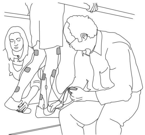
FES is applied through electrodes on the leg muscles during assisted walking. 2

The electrical stimulation is then gradually turned up until the muscles begin to tense or contract. Depending on your sensation, as the machine is turned up, you may feel pins and needles or other unusual sensations, which may take some time to get used to. The aim is to create a forceful but tolerable muscle contraction.