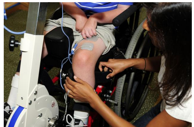
FES electrodes are placed on the leg muscles to be used during stationary cycling. 1

FES is delivered using a variety of handheld or specialized commercial electrical therapy machines connected to electrodes that are placed on the skin surface. Systems are also available with implanted electrodes in the muscles, although this is very specialized and not widely available.