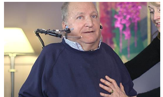
Some people with SCI need help with breathing and coughing. 5

Blood pressure care may involve learning to manage and care for orthostatic hypotension and other blood pressure problems using medications, exercise, compression garments, or change to salt and fluid intake.