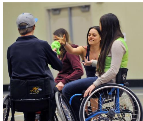
Peer mentors can offer emotional support and practical advice on living with a SCI. 11

Recreational therapists specialize in developing the abilities needed to participate in leisure activities.