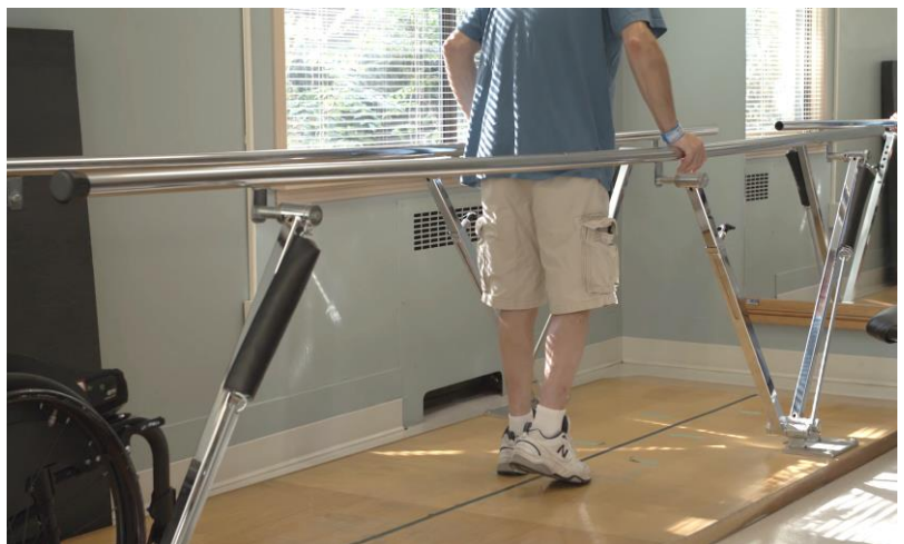
Part of rehabilitation may focus on developing mobility skills, like walking or using a wheelchair. 1

Rehabilitation is tailored to each person’s unique needs and goals. It may involve medical and nursing care, rehabilitation therapies (like physiotherapy, occupational therapy, or respiratory therapy), and a number of other health services to help ease the transition from the hospital to the community.