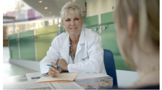
Working with a sexual health clinician may be a part of rehabilitation. 6

Head injuries can often happen at the same time as an SCI. Care for these injuries involves consulting with brain injury specialists and receiving treatments for these injuries.