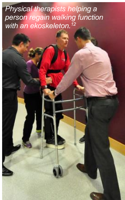
Physical therapists helping a person regain walking function with an exoskeleton. 12

Physiatrists are medical doctors specializing in rehabilitation and provide care to persons with SCI. They help determine if an individual should participate in rehabilitation and treat many of their physical issues.